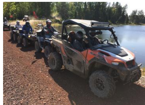
Foothills State Forest Ride—To join a ride, visit WoodtickWheelers.com