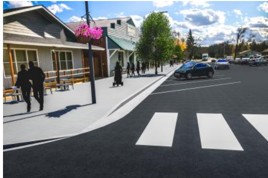
Rendering of First Street Boardwalk

Both sides of First Street and one side each of Whipple and Murray Avenues will get decorative LED lighting and new trees. (Due to existing overhead wires, business structures,