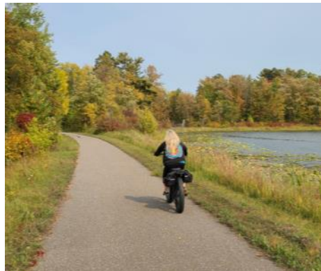
Enjoy an e-ride on the Paul Bunyan Trail

As kids became adults, we found we had time to fill for ourselves. (Self-care is crucial.) That's when we found our first pair of Rambo Electric Bikes. With pedal assist, we were able to conquer the outdoors like never before! On a full battery, you can travel up to 20 miles with mild pedaling. On- or off-road, wherever you want to go, your